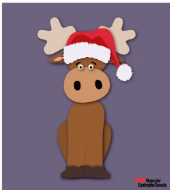
Board: Moose illustrations

Moose illustrations were created for the Holiday Ornament Campaign 2016, Muscular Dystrophy Canada (MDC) (French: Dystrophie musculaire Canada) is a non-profit organization that strives to find a cure for neuromuscular disorders. The Holiday Ornament Campaign supports over 50,000 Canadians affected by neuromuscular disorders. Proceeds go to support various programs and services.